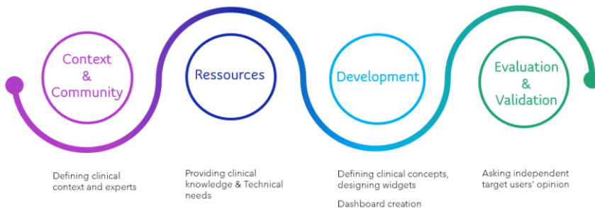
Figure 1. Four phases of creating a clinical dashboard: 1) Clinical context and community 2) Necessary resources 3) Development 4) Evaluation & validation.

We created a working group including relevant profiles, such as HCPs, experts in information technology (IT) and clinical informaticians. Subsequently, the group defined four phases, illustrated in figure 1, to create a clinical dashboard.