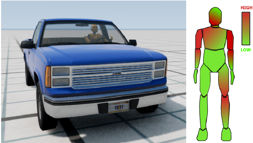
Figure 2. Left: Real-time render of BeamNG.drive with dummy placed on driver seat Right: Visualization of a possible representation of forces enacted on dummy during crash.

First, provide an overview of the entire scene of the accident with all cars involved. This will be implemented, by using the stand-in vehicles and the transmitted GPS location. A tier system, assigning colors to the severity of the simulated injuries will be employed to visualize the vehicles with passengers in critical condition. Selecting a vehicle then provides a view of all occupants represented by the corresponding 3D dummy. As shown in Figure 2, a heat map of the experienced forces can be assigned as a texture, and selecting a dummy produces the list of assumed injuries derived from the injury model.