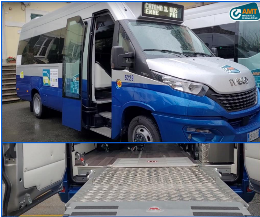
Figure 2. Antola-Tigullio DRT pilot vehicles.

The second experience, which is currently in the pilot phase, concerns a non-urban context, of the Internal Areas identified by the National Strategy, the Antola-Tigullio Area, that includes 16 municipalities from Genoese inland area, where less than 20 000 inhabitants live on a very wide territory, in poorly dense settlements.