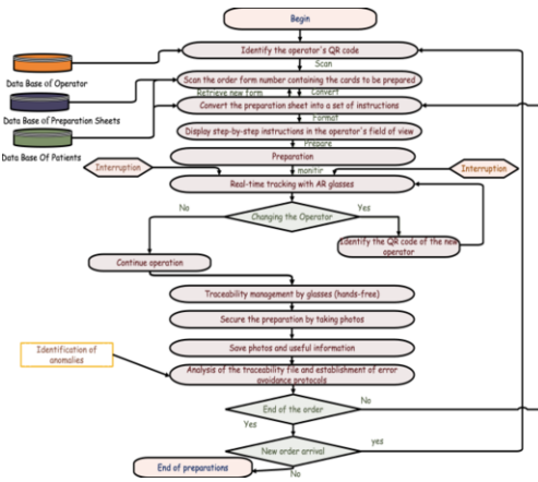
Figure 2: Smart Prep Functioning

CHIMIO® software. The different steps of “Smart Prep” functioning are detailed in Figure 2.