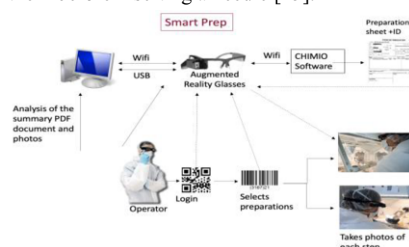
Figure 1: Smart Prep Architecture

AR can be defined as an interface between virtual data and the real world. It is a technique which overlays reality with its digital representation updated in real time. It thus offers the user possibilities of interaction in real time. This technology is in full development in the healthcare field, and is used, for example, to model the organs and blood vessels of patients in 3D, thus facilitating the learning process and the work of surgeons, in particular to create precise 3D reconstructions of tumors [13, 14]. The AccuVein® scanner is another example. It illuminates the veins on a patient's skin, which helps nurses and doctors to locate them before inserting a needle [15].