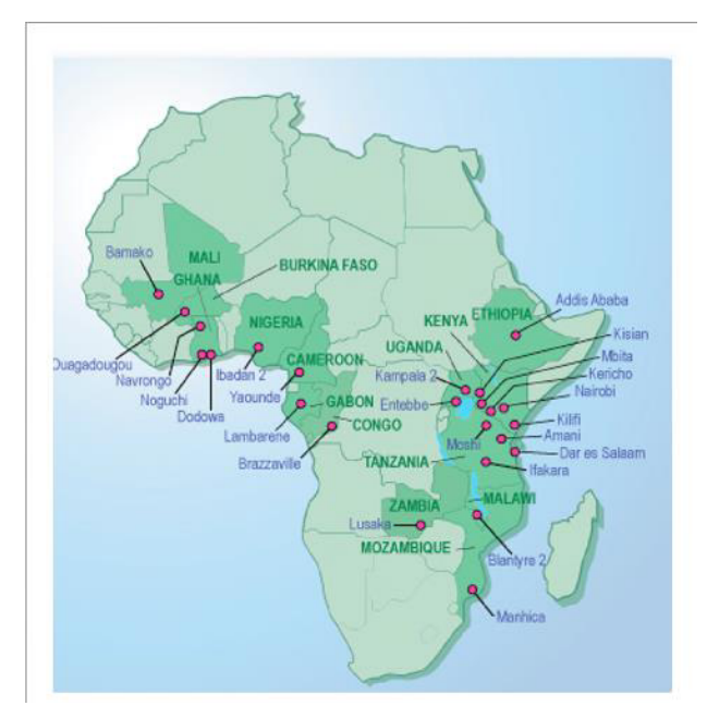
Figure 1. MIMCom Sites in 2011

search MED LINE and read abstracts. Getting full text articles was still a challenge. Partner universities with well-stocked medical libraries stepped into the breach. A few years later, full text access became easier for all with the advent of NLM's PubMed Central. The WHO-organized HINARI program also assisted lesser developed countries with access to medical literature.