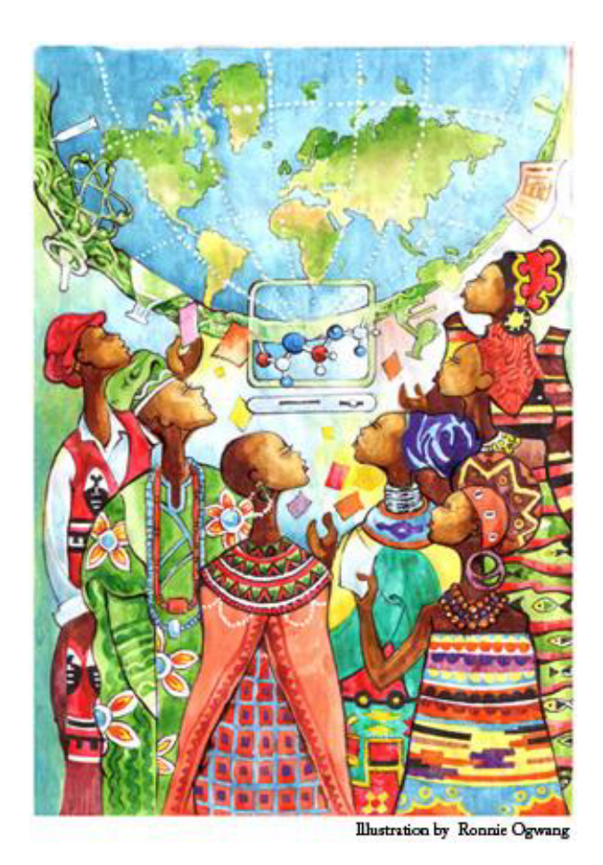
Figure 2. Artwork commissioned for the African Digital Health Library project