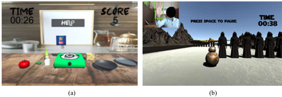
Figure 2. Unity 3D serious games: Game's environment for cognitive rehabilitation (a); Gameplay and tracking system which determines the movement of the player for motor-rehabilitation (b).