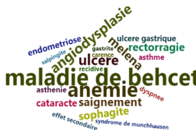
Figure 4 - The wordcloud. The bigger the term, the higher the TF-IDF value of that term. A click on a term triggers a search.