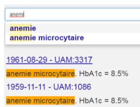
Figure 3 - The search box. Only the sentence containing the word is displayed in the results and the term being queried is highlighted.

The search engine suggests several noun phrases when a user starts typing (figure 3). Autocomplete finds terms present in the EHR and speeds up human-computer interactions.