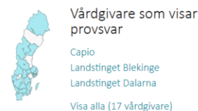
Figure 2 – map over which healthcare providers show lab results

The feedback received through the email inbox have been continuously used by the developers of the e-service to improve it. One example is that since such a high rate of emails concerned missing information, it became clear that the users had trouble understanding why parts of their record where not shown. In order to make this more clear to the users, an interactive map of Sweden was implemented in the e-service showing which regions made what information accessible. When choosing a specific part of the record (e.g. diagnosis or lab results), the map will also automatically show which regions make this information available (figure 2). This easily accessible visualization of information access may be the reason for the decline in emails in this category during 2017 compared to 2016.