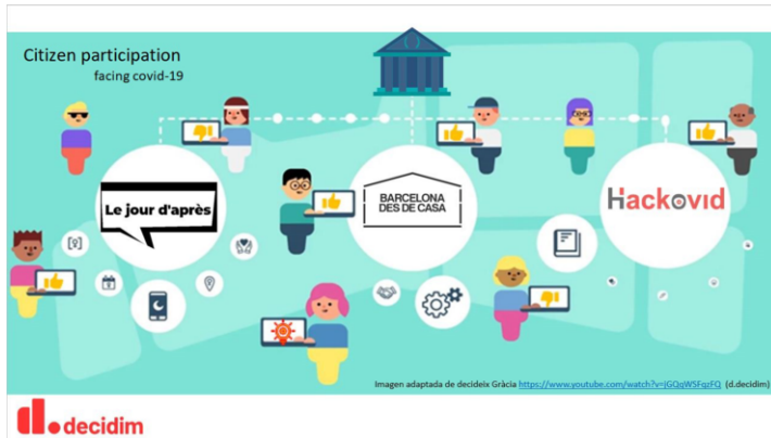
Figure 1. Different initiatives to face COVID-19 pandemic enabled by the Decidim platform.

from some social actors such as the initiative of Spaceship Media [10], which emerged in the United States in the context of the political fracture produced in the Trump era. They argue that dialogue from difference is essential for the proper functioning of democracy.