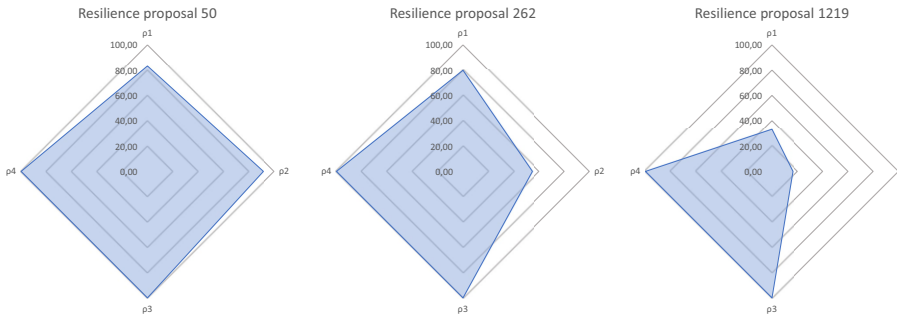
Figure 3. Radar diagrams of the resilience profiles for proposals 50, 262, and 1219.

the debate structure. Additionally, we propose a resilience metric for measuring the quality of the aggregated opinion and illustrate its application to debates conducted in the Decidim participatory platform. As future work, we plan to integrate both the hybrid aggregation method and the resilience measures in the Decidim open source platform. The literature on consensus in aggregation functions also deserves future exploration.