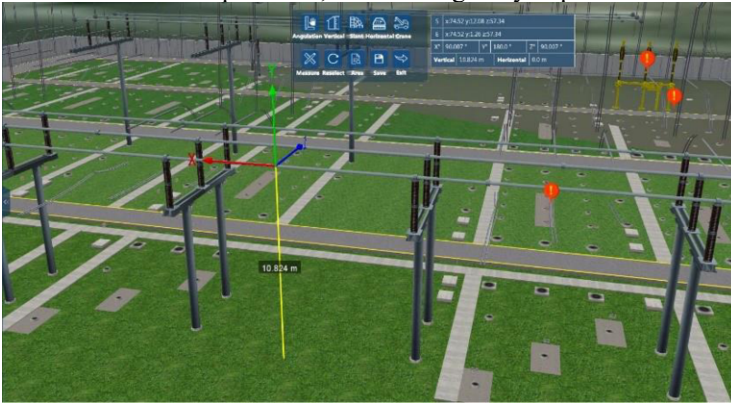
Figure 2. Illustration of distance measurement.

In the 3D2S2M, virtual on-site investigation can be performed to replace the on-site Investigation: measurement tools in the 3D2S2M are used to obtain 3D spatial distance parameters (including manual measurements, air-ground ranging,) to achieve the goals of field inspection and measurement, and then make accurate assessments and decisions about field operations. Accurate spatial distance information can also be used to evaluate and calculate various on-site operations, which will greatly improve the work efficiency.