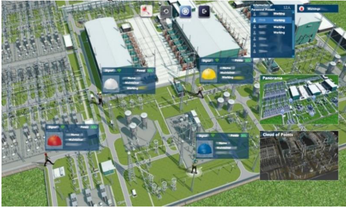
Figure 4. Illustration of positioning of personnel and equipment.

For working equipment with a height such as a crane, the height must be marked by tools such as laser detection and image recognition. The localization results of personnel and equipment are shown in Figure 4.