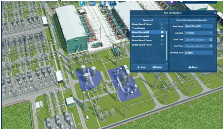
Figure 3. Illustration of the virtual working area setting based on three-dimensional electric fence.

For example, when ranging in our three-dimensional scene, let S be the starting point and E be the end point. In the 3D2S2M's 3D scene, the values of their X , Y , and Z coordinate axes will be displayed accordingly. Our angle of X (or Y , or Z ) is defined as the angle between the line connecting these two points and the X axis (or Y , or Z ). The distance between the two points is defined as the straight-line distance between the two points. Moreover, the horizontal distance is defined as the distance between the two points in the same horizontal direction. Figure 2 shows an example of distance measurement in 3D2S2M. The measurement result is 10.824m in this example.