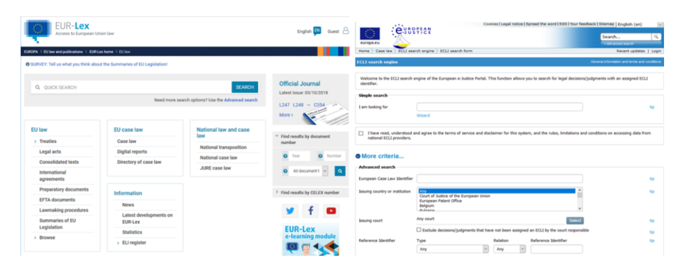
Figure 1. European database initiatives

The process of setting databases providing access to national and European case law in the area of cross-border litigation and civil cooperation has so far involved different initiatives undertaken by the European institutions or supported by them. The first steps in this direction have included the creation of databases in the area of cross-border litigation accessible through the EUR-Lex and the EU e-Justice Portals (Figure 1). A few initiatives can be singled out: namely, the JURE collection containing national judgments related to jurisdiction, recognition, and enforcement in civil and commercial matters<sup>5</sup>, the National case law web page dedicated to EU case law<sup>6</sup>, and the e-Justice ECLI search engine<sup>7</sup>.