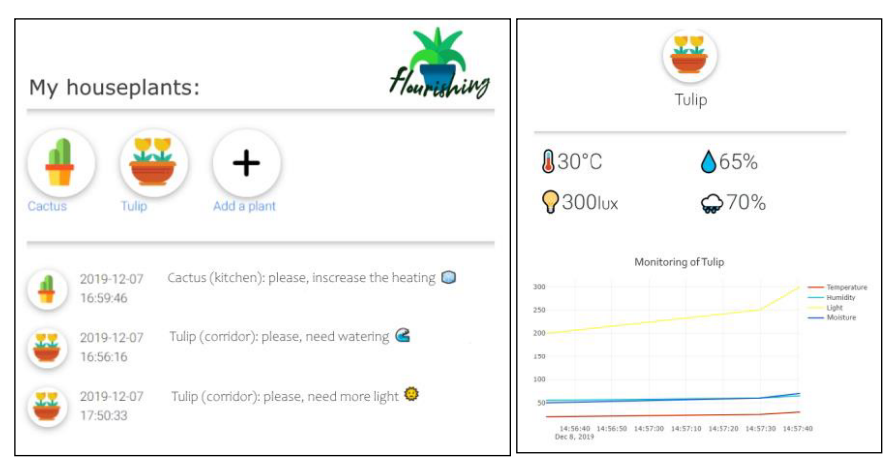
Figure 3. Dashboard with alert messages (left) - Houseplants monitoring interface (right).

The dashboard (Figure 3, left side) displays all the received alert messages. For example, on December 7, 2019, the houseplant asked to "increase the heating". The monitoring interface (Figure 3, right side) makes it possible to visualize data about ambient temperature, humidity, soil moisture, and light, all in real time.