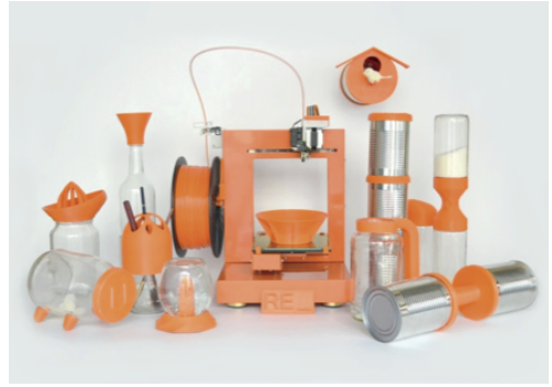
Figure 2. Objects belonging to "Project RE_" from Samuel Bernier

Project RE_ explores 3D printing as do-it-yourself tool for reuse of products. Samuel Bernier expands the functionality of used cans and jars through the addition of customized lids. Fourteen new objects were designed, e.g. piggybank, pencil holder, orange press (figure 2)(Bernier, 2012). Additive manufacturing enabled this project for several reasons. Direct fabrication from the CAD model allows for adaptation to the different packaging materials through small-scale production and the absence of specialized tooling. In this way the circular design strategy for adaptability and upgradability is adopted. Following the open-source character of 3D printing (Kohtala, 2016; Tymrak et al., 2014; Van Wijk & Van Wijk, 2015), Bernier shares his files online, allowing his customers to adjust and print the objects themselves, leading to design for attachment and trust, i.e. the person-product relationship is strengthened through effort investment during the personalisation process (Mugge et al., 2009).