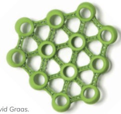
Figure 3. The "Screw it" vase from David Graas.