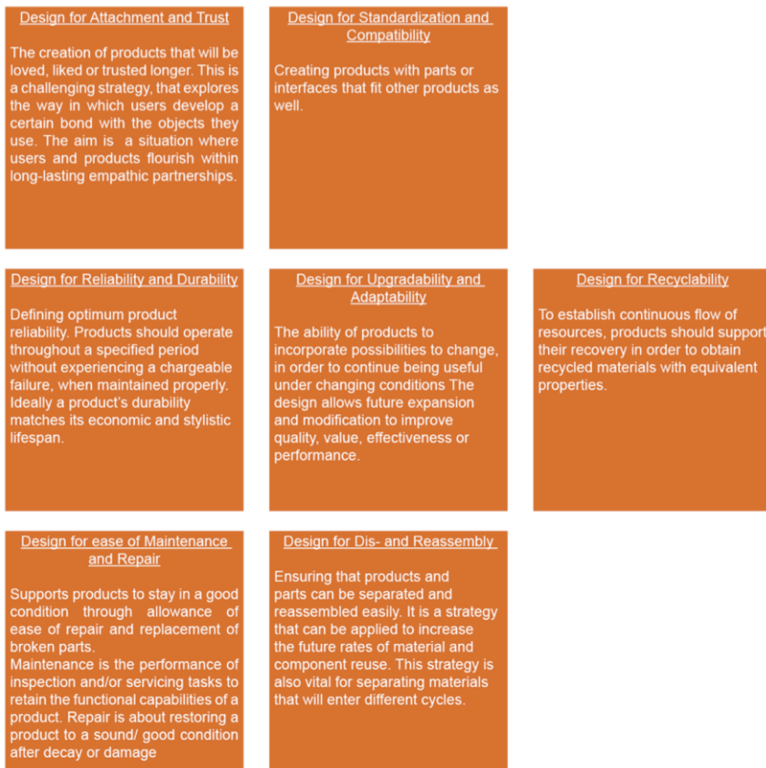
Figure 1. Circular design strategies (Bakker et al., 2014; Bocken et al., 2016).

This comparison of literature review and circular design strategies is placed in context by the five selected design projects. Below, each case is described in terms of circular design strategies and how these were applied through additive manufacturing.