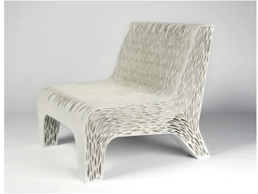
Figure 5. “BIOMIMICRY soft seating” from Lilian van Daal.

4. “BIOMIMICRY soft seating”: Lilian van Daal (2014) Van Daal designed a seat fabricated in one print, but expressing different material properties through different local structures (figure 5) (Daal, 2014). The chair is a good example of the design abilities of additive manufacturing to support design for recyclability. It represents the ability of AM to create complex shapes, leading to several benefits. In this case the variation of local structures makes ‘assembly of parts’ redundant; the seat is fabricated with only one material, enhancing not only recycling, but also simplifying the supply chain (Despeisse et al., 2017; Prendeville et al., 2016). This augments the ability of local recycling, which can lead to avoidance of information loss and a higher efficiency rate. Kreiger et al. (2014) found that distributed recycling could save up to 80% embodied energy for HDPE filament in areas with a low-density population.