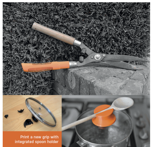
Figure 4. Some examples of "Value added repair" from Marcel Den Hollander and Conny Bakker.

In this project the lifespan of existing products is increased through repair, using the flexible design aspect of additive manufacturing. The design flexibility allows the creation of a component that fits the broken product, but also to adapt it. The central idea is that through customization of the broken part, a repair cannot only restore the product, but can add value in addition (figure 4). The improvement of the old product, by introducing extra functionalities, adds an extra dimension to repair. It supports design for "attachment and trust" and "upgradability and adaptability" can only be realized, because of absence of specialized tooling and small scale and local production.