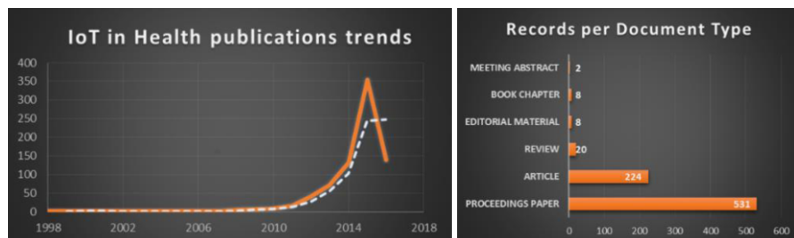
Figure 1. IoT in Health : a) publication trends ; b) document types

Publication Data Collection: Figure 1(a) summarises the number of publication between 1998 and 2016. Publications of 2016 are included as they appear in Web of Science until September. The solid line represents the number of articles, while the dashed represents the moving average trend line. As the figure reveals the publications of IoT in Health are continuously growing. Document Type: The majority of the published literature in IoT in Health are proceedings papers while less than half are articles in journals. Twenty (20) are reviews while editorials, book chapters and abstracts are also present (Figure 1(b)).