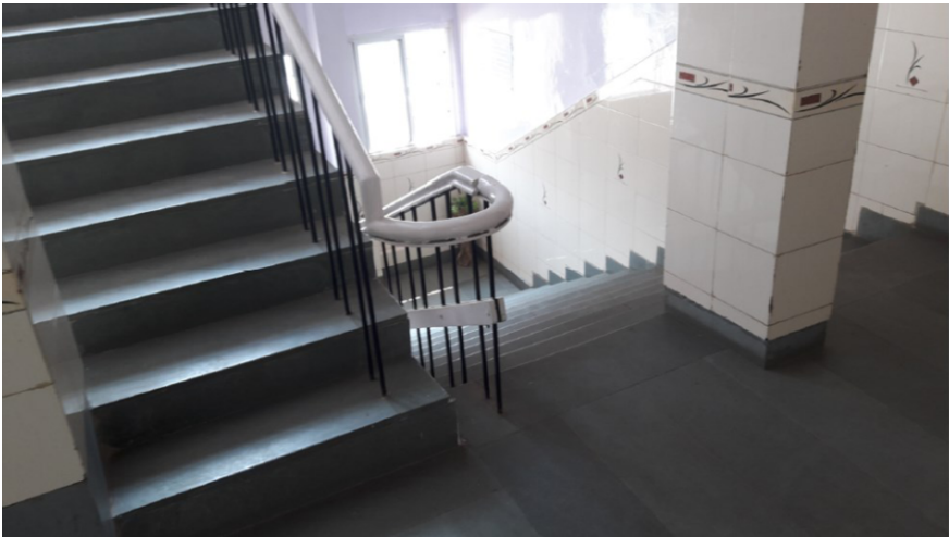
Figure 2. SSEH – Handrails are provided on one side only and there are no contrast colour edges on the step.