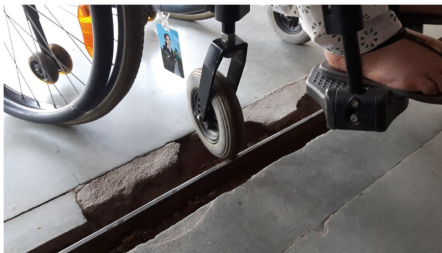
Figure 4. Gandhinagar vision centre – The channel of the iron gate creates a gap between the ramp and the flooring, and is potentially hazardous for people using mobility aids, such as wheelchairs and white canes.

Following the audits, Samarthyam submitted a report, and Sightsavers and its partners worked with an engineer to evaluate the cost of the interventions required to make the health facilities universally accessible. A plan was subsequently elaborated to identify short-, medium- and long-term priorities, and works are scheduled to begin in July 2016.