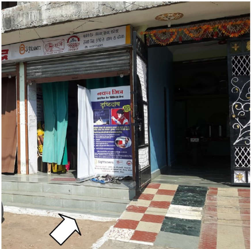
Figure 3. Anand Nagar vision centre – Steps mark the entrance to the centre and step risers are unequal. No handrails are provided. A ramp with gliders is provided in the adjacent building, which has a side entrance to the centre.