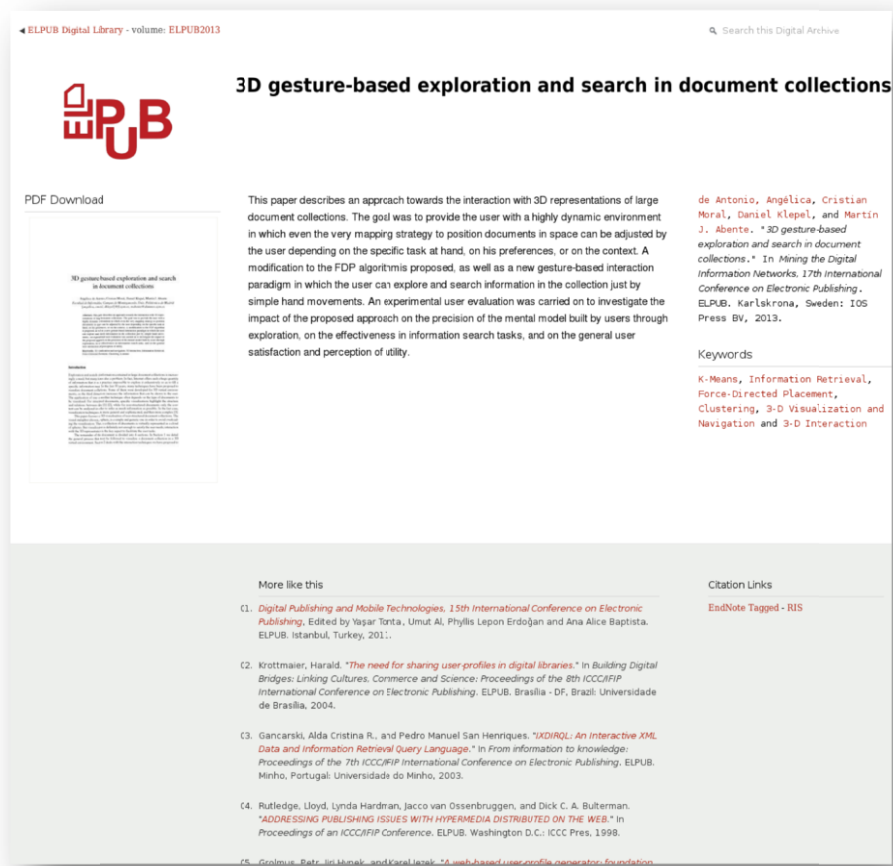
Figure 5. Document record, with (1) a system generated preview of the full content and download link, (2) document title and abstract, (3) links to the author and keyword page, (4) related content provided by the vector space model, and (5) citation links.

This paper described the switch of the ELPUB Digital Library towards a novel environment. The design parameters have been pointed out and a depiction of the system’s interface was presented. It is to be regarded as an open invitation to the ELPUB community to use the novel platform, i.e. to experiment and research beyond the annual conferences.