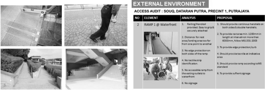
Figure 4 & 5. Pictures of existing facilities provided and barriers were identified and the report provide relevant solution in terms of proper specification and referral sources of designing options, if further upgrading of existing facilities is to be commence in the near future for a better built environment to be socially sustainable.

As a lecturer from Department of Architecture of Kulliyyah of Architecture and Environmental Design, International Islamic University Malaysia (IIUM), I have prepared “Barrier Free Architecture” course outline as an elective subject for Bachelor of Architecture program. The objectives is to instill IIUM graduates of the understanding of the concept of ‘barrier free’, ‘design for all’, ‘inclusive design’ and ‘universal design’ and its application to be incorporated into graduates’ architectural profession and also to impart knowledge on the significant roles and responsibilities of professionals that is to ensure the physical environment is designed and accessed for all. Upon completion of the course, students should be able to identify the concept of barrier free architecture and Universal Design in their design, discuss and understand the difficulties and measure challenges faced by PwDs through access audit simulation activities as well as demonstrating good practice in various building and produce design solution with reference to Malaysian Standards (MS), Buildings By-Laws and development requirements related to provision of accessibility.