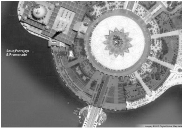
Figure 1. The access audits conducted are at public buildings and public spaces where the Persons with Disabilities (PwDs) will use and visit those areas.

The methodology applied includes observation and access audit module. This is to determine the frequently used area or route encountered by Persons with Disabilities (PwDs) is by conducting access audits at several case studies of public buildings. The objectives of access audit is to enhance understanding and awareness of Universal Design application through talks and seminars of experts and life experiences from persons with disabilities (PwDs), and further conduct an access audit to existing buildings in identifying problems and barriers faced. The access audit reports produced would be crossed referred to with Malaysian Standards (MS), Buildings By-Laws and development requirements related to provision of accessibility.