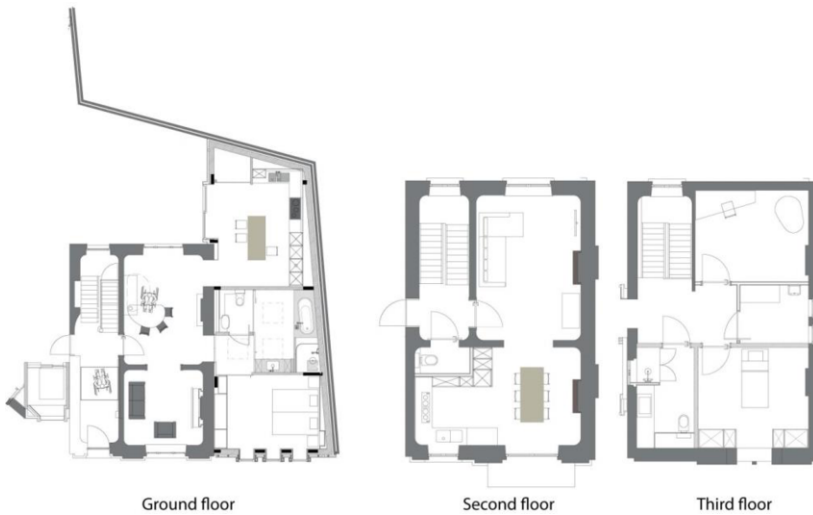
Figure 6. Ground floor (left), 2nd floor (middle) and 3rd floor (right) plan of the housing units

This early twentieth century dwelling offered a huge amount of challenges at several levels. A renovation project is fundamentally different from a contemporary building with respect to the actual concept, building materials and construction techniques. The decisive reason for a renovation project was that this house typology would be very recognisable for many people living in a similar house in Belgium. The program of the UD-lab emulates three main ambitions: demonstrating, offering information and conducting research in Universal Design. The lab consists out of an entrance hall linked with a visitor and information centre and two housing units. The total surface area of the lab is 485 m 2 (demonstration house 264 m 2 , visitor center 156 m 2 and open space laboratory 65 m 2 ) (Figure 6). At the heart of the living lab is the demonstration house that shows the latest innovative solutions in design like different inclusive systems to open doors, an adjustable kitchen, high tech domotics to assist your wishes in the environment, ... During the UD-process choices were made based on feedback of user/experts showing different options.