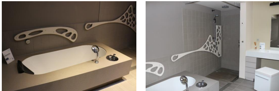
Figure 3 & 4. Art work support bars in bathroom

architectural students and students in occupational therapy can test this installation together with user/experts. This way future design can be improved.