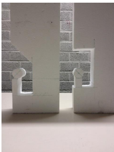
Figure1. Models of handrail

Arts of the university of Hasselt and the Department of Healthcare of the university college PXL. The feedback of user/experts was crucial for all UD-results and elements to assure that there was a non-stop process of UD-ing. By means of “designing”, different teams searched for innovative solutions. Several design elements were also designed on the site and at scale 1:1. Researchers, experts, students, designers, constructors and users were all involved. For example the design of a handrail was based on different expertise's. As the building was listed as a monument it was not manageable to change all the original details and constructive elements. Only one handrail was present next to the protected staircase. Based on the suggestions and conditions as described by users and experts, models were made in order to find a solution for the prototype of an additional handrail (Figure 1 & 2). For the actual location of the handrail, the architect together with two UD-experts searched for the right location on site. The handrail was placed on a crucial place next to the staircase. This place was limited because of the context of preservation, the laboratory point of view and financial reasons.