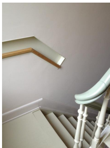
Figure2. Built hand rail (right)