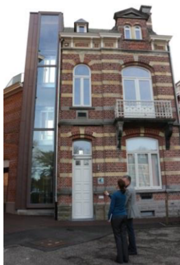
Figure 5. Facade renovated porter's lodge

One of the first considerations of the management and early design team was the location of the lab. Could it be a new house or would it perhaps be a lab built as a laboratory within the university or should we start renovating an existing house? The preferred choice of the project and location was a house listed as a monument and protected by the Monuments office. It is a typical historical row house dated 1913 and used to be a porter's lodge of an old maternity hospital (Figure 5).