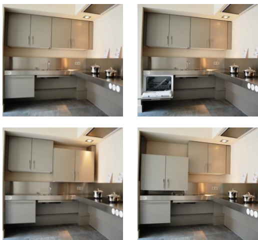
Figure 8. Kitchen on ground floor level

All corridors and doors allow circulation with buggy's, wheelchairs, rollators/walkers and people giving support or assistance to a user. Rotating doors facilitate the use for everyone. Doors can be slid in order to create more space or guarantee privacy. The bathroom, adjacent to the toilet, can be enlarged with an interesting system of sliding doors. By means of home automation, each place can be adjusted from a pleasant working environment to a relaxing place to rest with different lighting techniques and automation. For example a 'Smart Television' in the living room provides, apart from entertainment, a series of services for people. Besides the fact that these techniques are very usefull for all of us, people with reduced mobility and/or sensorial functional limitations (voice and image recognition, remote control front door) can delegate several actions without the need to move. For people who are tired or with reduced stamina who want to cook while sitting, the kitchen dresser together with the dishwasher can be adjusted to the preferred height (Figure 8). Simultaneously a servo-drive motorized system placed on the kitchen cabinets increases usability.