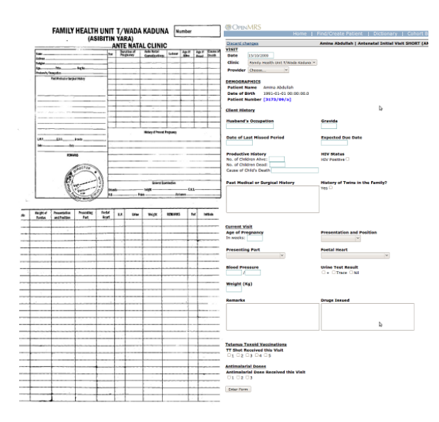
Figure 2- Antenatal Paper Card vs eForm

management but also aggregate data at the clinic, district and state level [8].