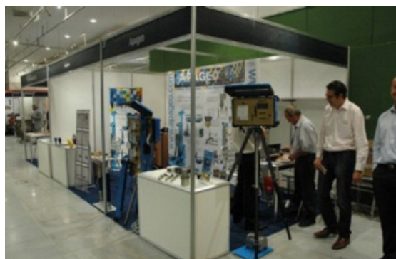
East Exhibition Hall

The conference in Alexandria brought together academics and practitioners from around the globe who share an interest in geotechnical engineering and working together to develop innovative ideas that will contribute to the future successes in our profession and the built environment in which we all live.