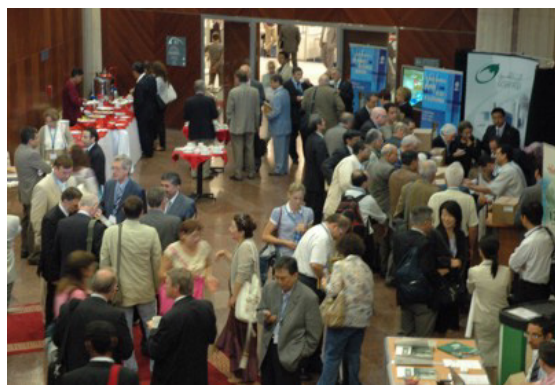
Level B1 Open Exhibition Area