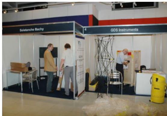
Stand Set-up, West Exhibition Hall