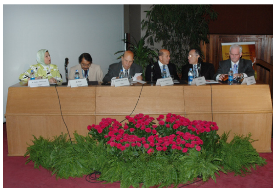
Opening Ceremony Speakers Table