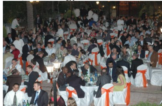
Gala Dinner, 6 October 2009

An Egyptian Cultural Evening was held at Antoniadis Gardens in central Alexandria on the evening of 8 October, where attendees, who included most conference participants and their accompanying persons, were able to experience the sights, sounds, and tastes of Egypt.