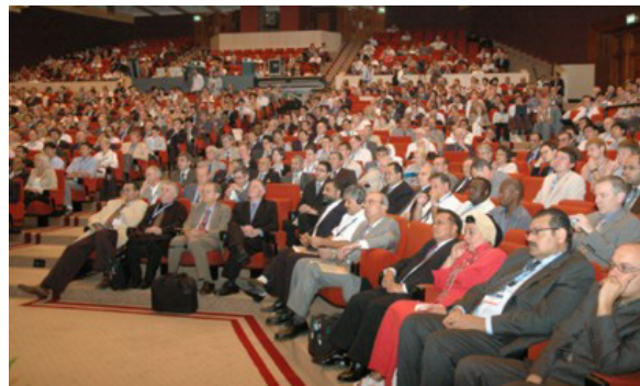
Plenary Session Day 1