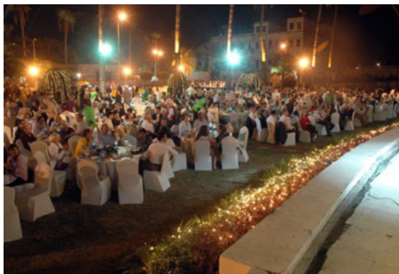
Cultural Evening, 8 October 2009