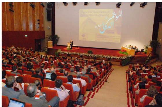
17 th ICSMGE Opening Ceremony