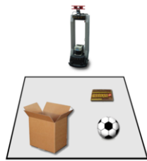
Figure 4. Sample visual scene including 3 objects: a box, a ball, and a chocolate bar

The word error rate remains nevertheless quite high. This is due to several reasons. The major issue is that the words causing most recognition problems are – at least in our test suite – function words like prepositions, discourse markers, connectives, auxiliaries, etc., and not content words. Unfortunately, the use of function words is usually not context-dependent, and hence not influenced by saliency. We estimated that 89 % of the recognition errors were due to function words. Moreover, our chosen test suite is constituted of “free speech” interactions, which often include lexical items or grammatical constructs outside the range of our language model.