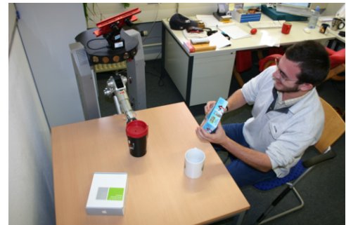
Figure 1. Example interaction

The structure of the paper is as follows. We first situate our approach against the background of situated dialogue and ASR, and introduce the software architecture in which our system has been integrated. We then describe the salience model, and explain how it is utilised within the language model used for ASR. We finally present the evaluation of our approach, followed by conclusions.