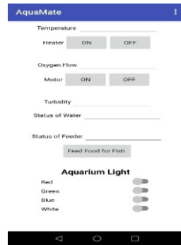
Figure 3. Mobile App